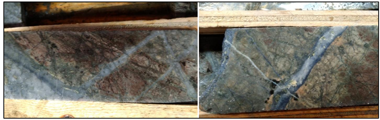
Figure 1. Mineralized drill core from hole S20-220. Left: moderate biotite hornfels cut by stockwork quartz-chalcopyrite-molybdenite veins. Right: molybdenite rich quartz veins with bleached sericite altered halos cutting maroon biotite hornfels.