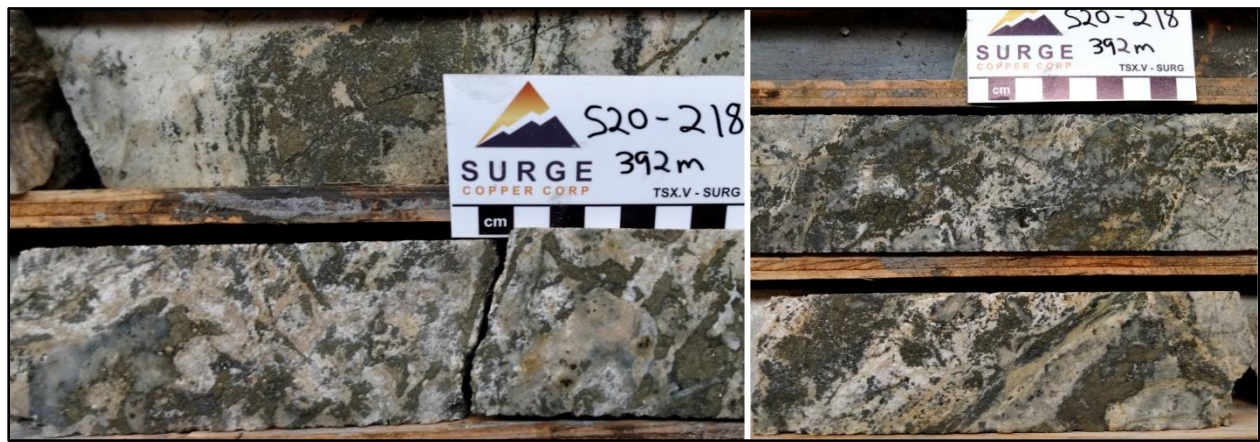
Figure 3. Core from Hole S20-218 around 392 metres depth. Pyrite rich veins and breccias associated with quartz, white clay, and containing low-grade gold mineralization.