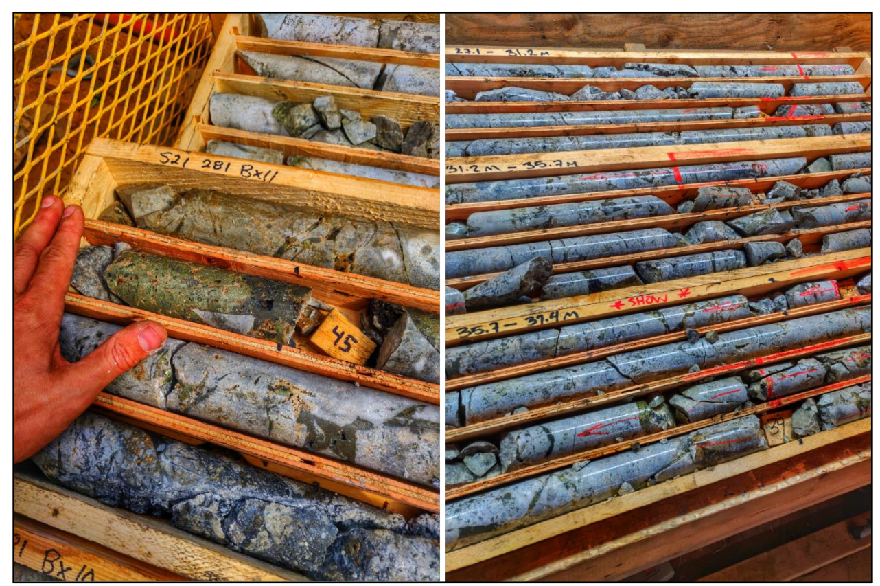
Figure 3. Photographs from recent drilling at the Seel Breccia Zone. Left: 20-centimetre-wide semi-massive chalcopyrite zone within a widespread breccia from 45 metres depth in hole S21-281. Right: Breccia zone from 27 to 37 metres in hole S21-270. Note large blebs of chalcopyrite throughout the breccia matrix.

mineralization contains sulphides, including chalcopyrite, within a breccia matrix that also contains quartz and iron carbonate. Photographs of drill core from the zone are shown below. Sulphide minerals in the breccia matrix include chalcopyrite, pyrite, and sphalerite. Assays are pending for drill holes from this zone.