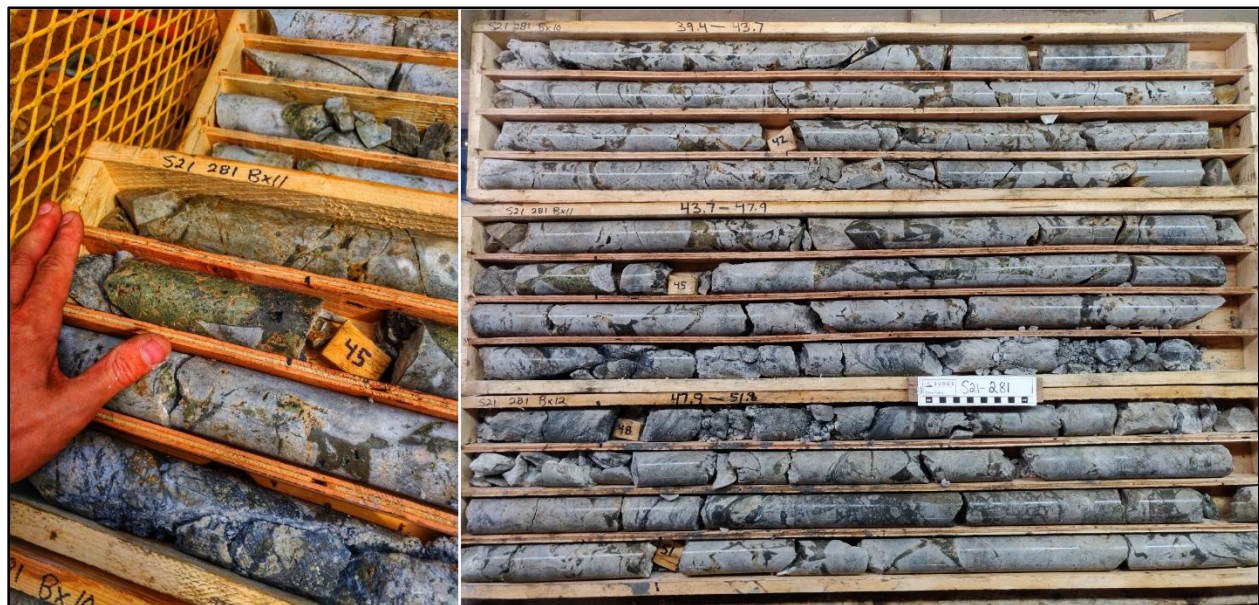
Figure 1. Photographs from hole S21-281. Left: Close up brecciated zone with semi-massive chalcopyrite at 45 metres depth. Right: Breccia zone from 39 to 52 metres depth.

The Seel Breccia is proving to be a near vertical to steeply south dipping breccia body ranging from 25 to 50 metres wide and extending to depths exceeding 100 metres from surface. Smaller parallel and irregular breccia bodies locally surround the main zone. These initial drill results show potential to significantly expand near surface high-grade mineralization well beyond the zone of historical drilling, and the area is being evaluated for its potential as a high-grade starter pit. A historical resource from 2014 on the Seel Breccia Zone located to the southeast of the current drilling outlined a zone containing approximately 1.1 million tonnes grading 0.42% copper, 12.6 g/t silver, and 0.06 g/t gold.