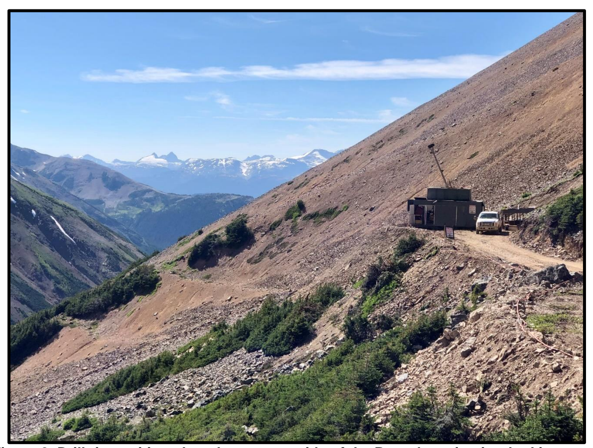
Figure 3. Drill rig positioned on the western side of the Berg deposit; view looking west.

secondary chalcocite blanket was observed from 40 to 130 metres depth. Hole BRG24-254 contains both increased brecciation and stronger grades than have typically been encountered in the Berg Stock. The hole returned 412 metres grading 0.40% copper equivalent (0.24% copper, 0.042% molybdenum, 5.40 g/t silver, and 0.019 g/t gold) from 36 metres depth to 448 metres depth. An interval within the supergene sulfide zone from 70 to 124 metres depth returned higher grades of 0.53% copper equivalent over 54 metres (0.39% copper, 0.036% molybdenum, 4.43 g/t silver, and 0.04 g/t gold). The hole also intersected strong grades within the hypogene system returning 0.68% copper equivalent over 18 metres from 194 to 212 metres depth (0.52% copper, 0.042% molybdenum, 5.36 g/t silver, and 0.05 g/t gold). This higher grade hypogene zone corresponds to both zones of brecciation and an interval of strongly biotite altered and veined andesite.