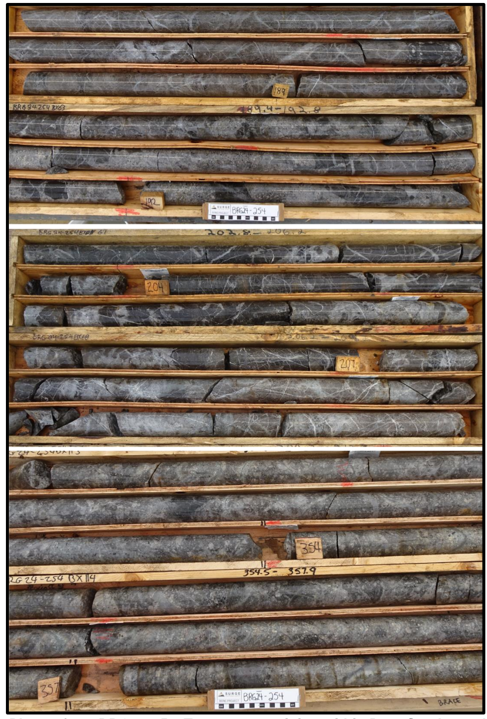
Figure 4. Photos from BRG24-254. Top: strong veining within Berg Stock porphyry with sub-angular clasts of dark biotite altered andesite. Middle: zone of higher grade hypogene copper mineralization with dark biotite altered andesite and lighter Berg Stock porphyry cut by abundant quartz-chalcopyrite-molybdenite and quartz-molybdenite veins. Bottom: intrusive matrix breccia with angular to sub rounded intrusive and volcanic clasts and strong quartz-molybdenite veining.